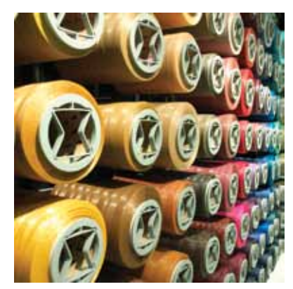
We offer styles available in a full spectrum of stunning colors never thought possible in postconsumer content carpet.