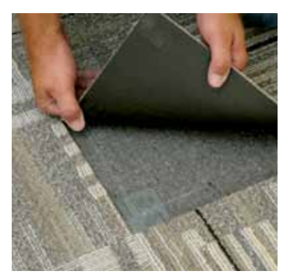
TacTiles create efficient, durable installations, while emitting virtually no VOCs so you have more flexibility.

Our revolutionary TacTiles installation system eliminates the need for glue, adhering tiles securely together to form a floor that "floats" for greater flexibility, easier replacement and long-term performance. With more than 20 million square yards installed, TacTiles connectors have proven to create less mess, less waste and offer greater savings, not to mention an environmental footprint that is over 90% lower than that of traditional glue adhesives.